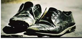
Social Justice Handbook SMALL STEPS FOR A BETTER WORLD